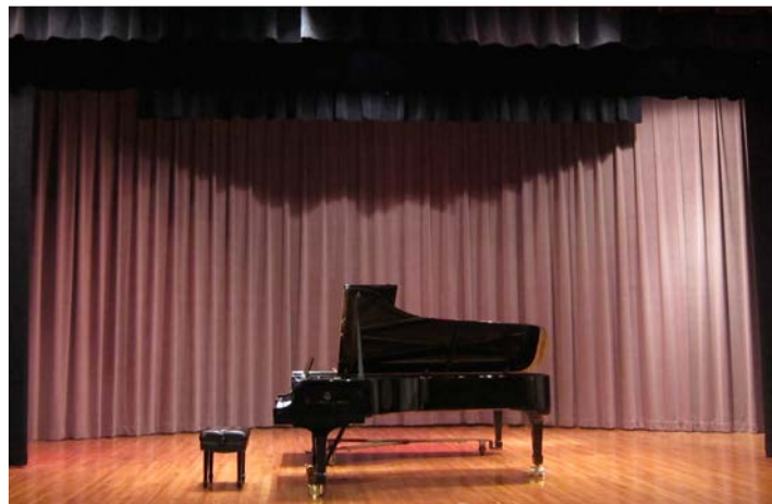
EWU Recital Hall – Steinway!