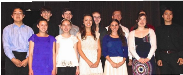
Honors Recital #2