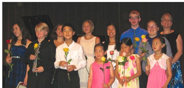
Young Composers Recital