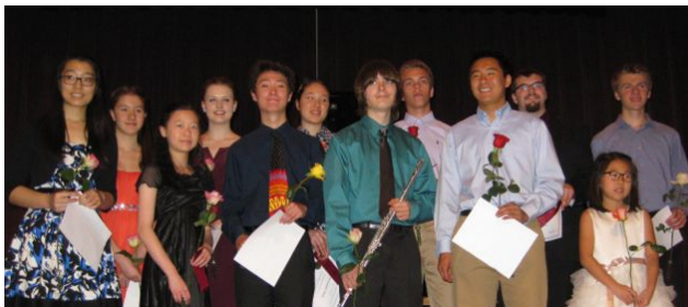
Honors Recital #1