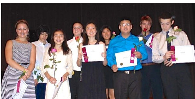
Honors Recital #3