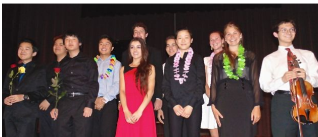
Honors Recital #5