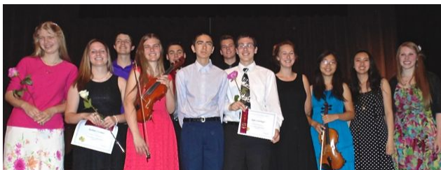
Honors Recital #4