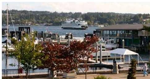
Bremerton Ferry in Sinclair Inlet

On June 19, 1915, immediately following adjournment of the Northwest convention in Tacoma, the Washington State Music Teachers Association was organized. In the words of its founders, "this Association is for the certification of the teacher and has for its special object the standardization of music in the schools throughout the State. County organizations will follow, and it is hoped that eventually a Pacific Coast organization will be made possible."