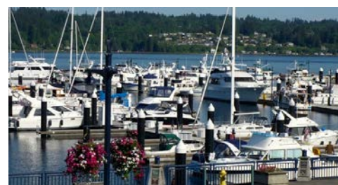
Marina at Kitsap Conference Center