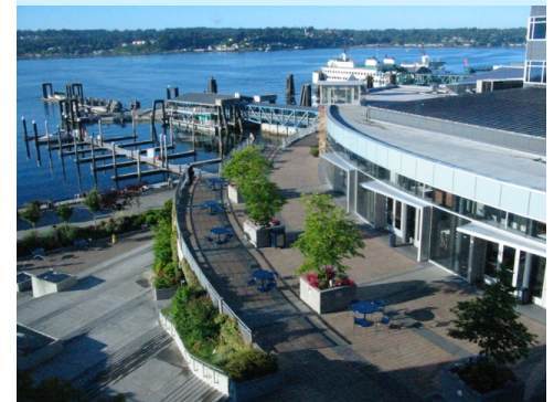
Conference Site (photo taken at the 2008 Conference). Background: Sinclair Inlet, new boat harbor, Seattle-Bremerton Ferry. Foreground: Bremerton Conference Center. Immediate left of photo: Hampton Inn.

Hampton Inn & Suites Bremerton 150 Washington Avenue