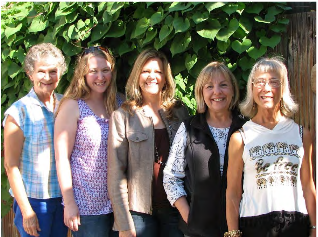
Okanogan County Chapter