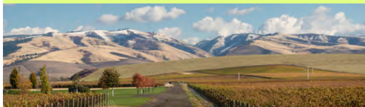
"Les Collines Vineyard with snow-capped Blue Mountains in background, Walla Walla, Washington"