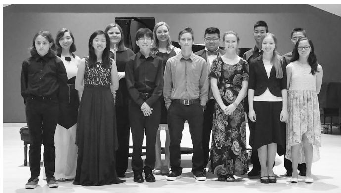
Honors Recital No. 1 · Wednesday Morning