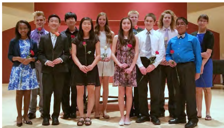
Honors Recital No. 3 · Thursday Morning