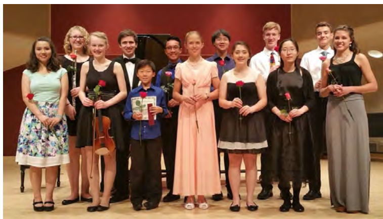
Honors Recital No. 2 · Wednesday Afternoon