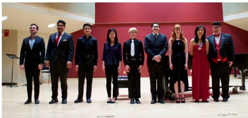
Washington State Winners Recital · Tuesday Evening

"Rhythm in the Blues" · June 21-24, 2016 · Whitman College · Walla Walla, WA