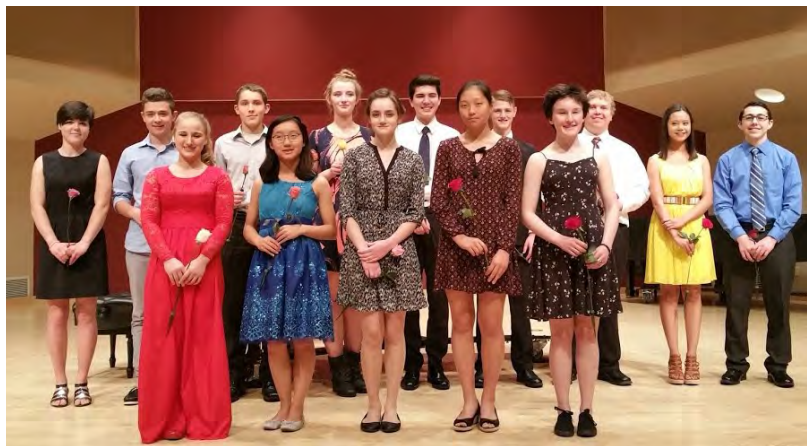
Honors Recital No. 4 · Thursday Afternoon