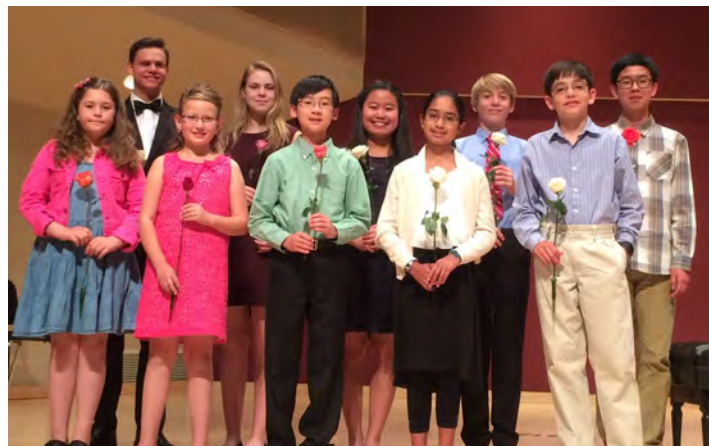
Young Composers Project Recital · Thursday Evening