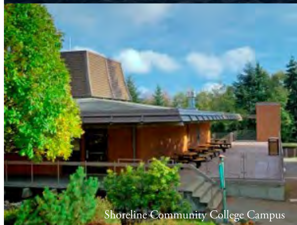
Shoreline Community College Campus