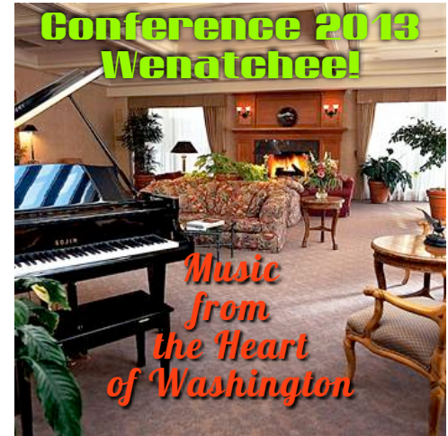
The Coast Wenatchee Center Hotel