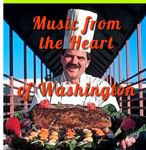
Chef on the Skybridge

We are looking forward to Music from the Heart of Washington , our 2013 WSM-TA Conference to be held at the Wenatchee Convention Center and PAC June 16 th - 20 th . Group rates are already set for us at the The Coast Wenatchee Center Hotel. For reservations, call (509) 663-1144 and mention that you are with the WSM-TA Conference. The hotel conveniently connects directly to our conference location via a skybridge. Driving directions will be printed in the May issue of The Clarion .