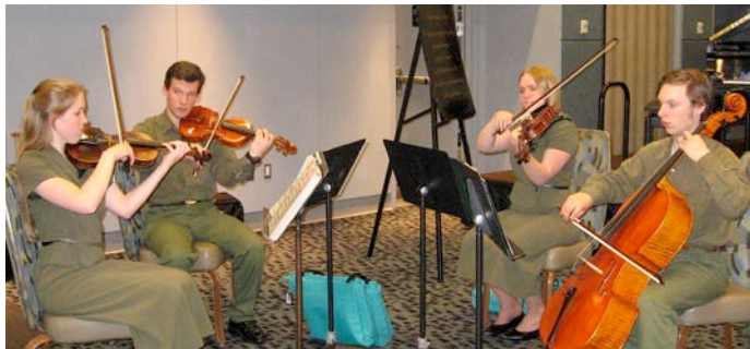
Kitsap County's Verde String Quartet serenading at the Banquet