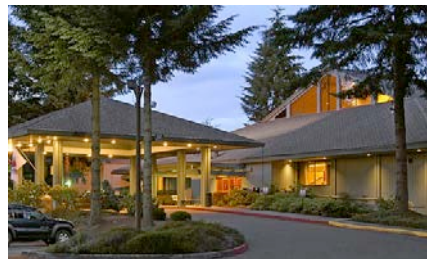
Red Lion Hotel, Olympia