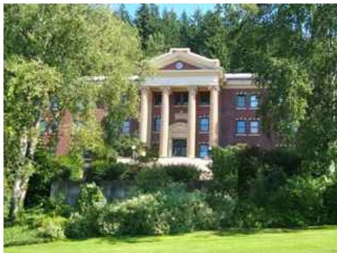
Edens Hall on WWU Campus

Our conference will be held on the campus of Western Washington University overlooking scenic Bellingham Bay. Western's campus is home to an eclectic collection of outdoor and indoor public art sculptures. The collection, funded in part by the Washington State Arts Commission and the National Endowment for the Arts, includes 30 works which conference attendees will be able to enjoy as they explore the campus.