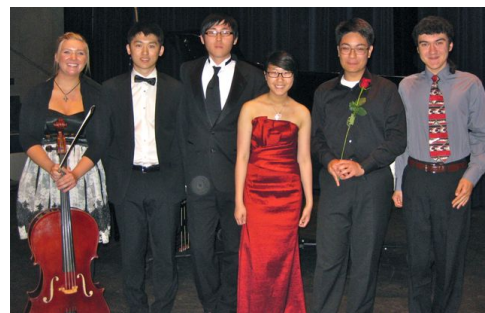
Representatives from the Washington State Winners Recital at the 2011 Conference