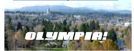
Downtown Olympia & the Black Hills

Time seems to be flying by quickly, and as you are reading this Clarion article, we are less than 5 months away from our annual WSMTA Conference. Here in Olympia, within our Chapter, committees are coming together to ensure that Conference attendees feel cared for and that details are covered to make sure that you will be glad you made the commitment to come.