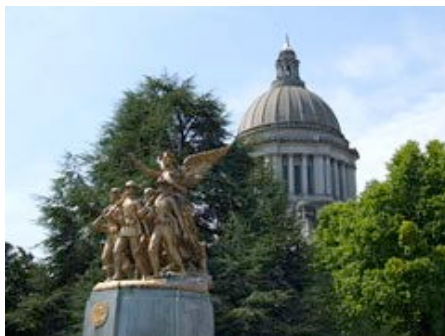
Winged Victory Monument in front of Capitol Building