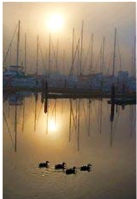
Four early Conference-goers arriving in the harbor at Olympia