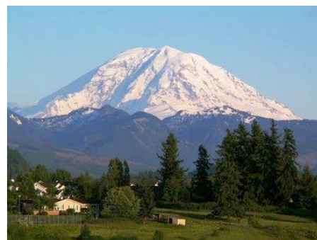
Mt. Rainier, near Olympia