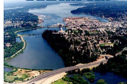
Aerial View of Olympia

It seems like a beehive of activity and planning here in your Capital City for our statewide Conference. Plans are well underway, and some key projects within the Conference are nearly complete. We are looking forward to seeing you, new and old friends alike!