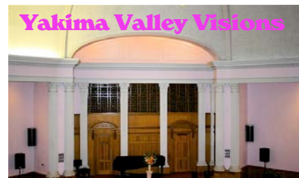
The Seasons Auditorium