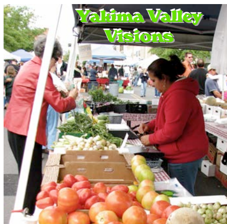
Yakima Farmers Market

B.T.W. Did you know that Yakima, "the Palm Springs of Washington", is featured in the March issue of Sunset Magazine ? Also, one of the best web sites for planning your trip is visityakima.com . It has lists and links to restaurants, hotels and attractions in Yakima and neighboring communities.