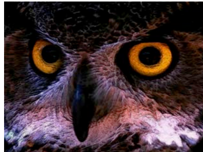
The wise old owl has his eyes on you! Did you forget to register for the WSMTA Conference in Yakima this month?

ad on the next page (page 8). It has been changed to July 1, 2009.