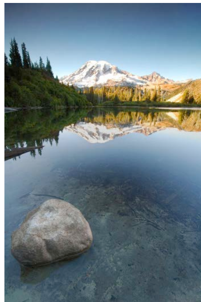
View of Mt. Rainier, from a lake, east of Olympia