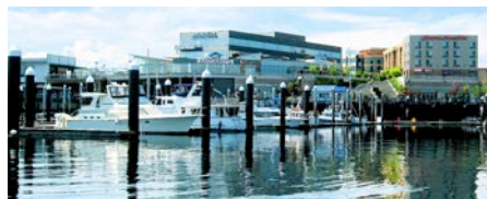
View of Kitsap Conference Center and Hampton from the Bremerton-Seattle ferry, saying goodbye to WSMTA Conference 2008