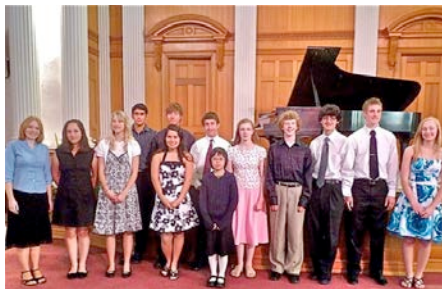
Honors Recital No. 4