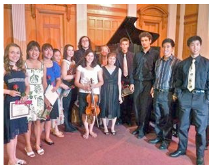
Honors Recital No. 3