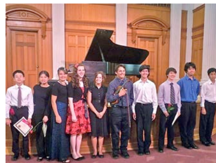
Honors Recital No. 5