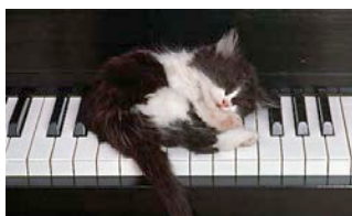
Cats will sleep anywhere!