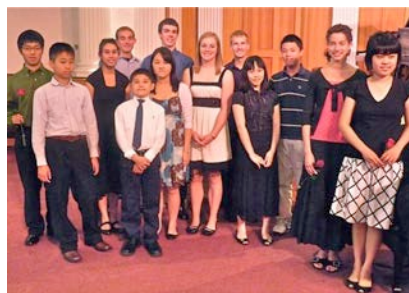
Honors Recital No. 2