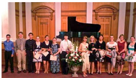
Honors Recital No. 1