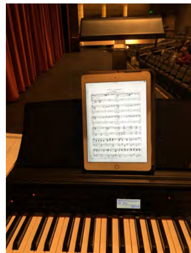
Using the ForScore app on an iPad along with the Bluetooth-connection PageFlip pedal.

And by the way, it does take some skill to use this fluently (I only gave myself two rehearsals—not enough time for me), so if you're considering splurging on a Bluetooth pedal for a specific event, give yourself ample time to practice with it. Now that I've taken the plunge, I'm using ForScore and the PageFlip for upcoming concerts, and have slowly started scanning in repertoire (there are lots of resources for free online digital scores, too) in my free time to have at the ready for future gigs. And my bag is considerably lighter with just my iPad and PageFlip inside!