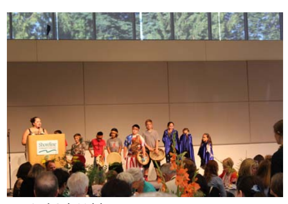
Quil Ceda Tulalip Elementary Drummers