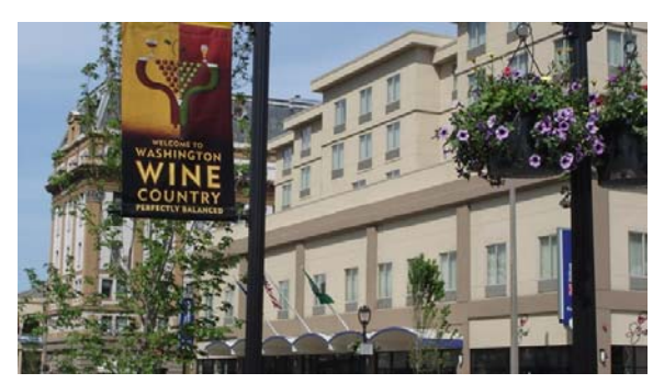
Hilton Garden Inn in Yakima, site of the 2017 Fall Leadership Seminar.

Much of the cost of the Leadership Seminar is underwritten by WSMTA. If you register with a roommate, the cost of your lodging is completely covered. If you'd like help finding a roommate, please contact me. Many chapters