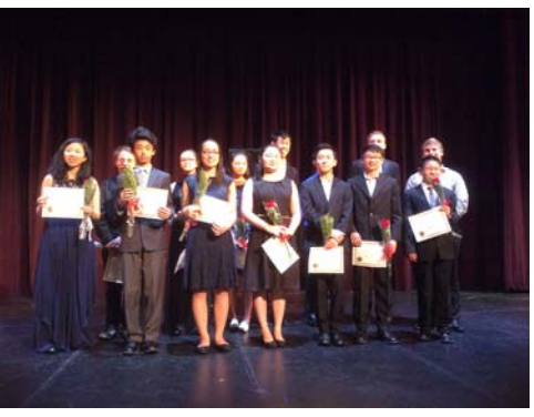
Honors Recital #4