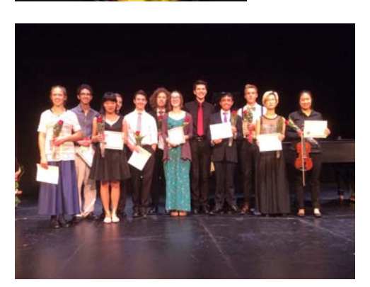
Honors Recital #1