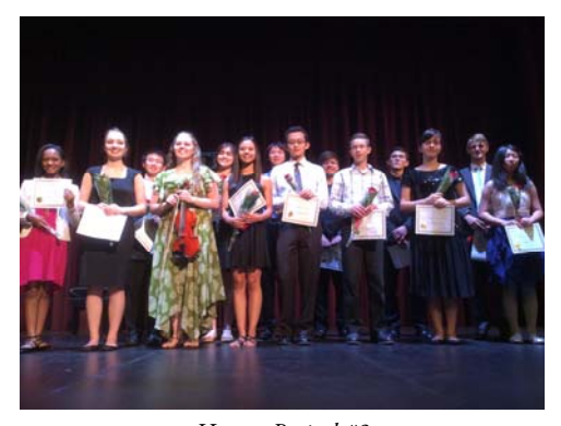
Honors Recital #3