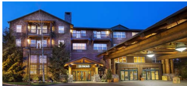
Heathman Lodge, Vancouver, WA