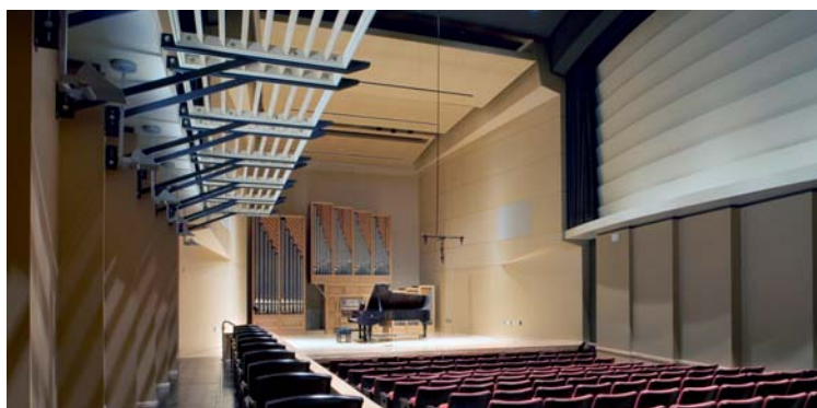
Recital Hall at Central Washington University's Jerilyn S. McIntyre Music Building