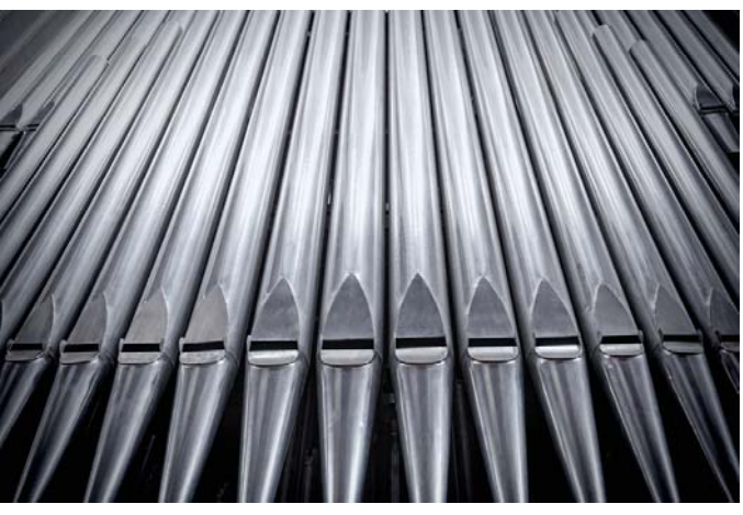
Enroll in a POE (Pipe Organ Encounter) this summer!

Guild of Organists (AGO), a POE is for ages 13-18. A POE+ is for adults. Both the youth and the adult programs offer the opportunity for participants to have private organ lessons, visit and play different organs, learn about the history and construction of the organ, and interact with others who also have an interest in the organ. POEs take place in several locations throughout the country. Popular locations often fill quickly, so it is not too early for your students to look into the