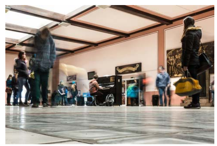
Music brings beauty and comfort into our busy, overbearing surroundings.

Music brings so much beauty and comfort into our busy, overbearing surroundings. We are constantly bombarded with noise and overloaded with information. Yet, I hear from many students that music brings them a sense of peace. So why do we keep this a secret?