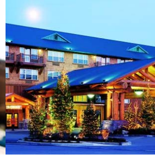
Relax and Rejuvenate at the Heathman Lodge