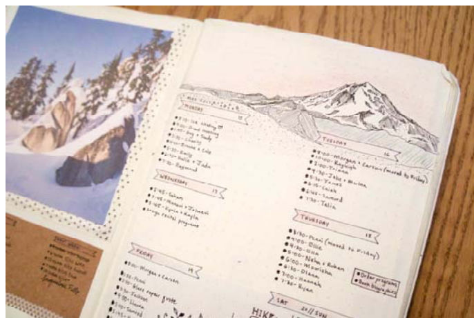
Leuchterm 1917 Dot Grid Journal for sketching, scheduling, and planning.

The beauty of the MTNA National Certification Program is that it offers all teachers the chance to work on meaningful projects that actually apply to our everyday