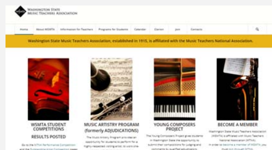
PHOTO COLLECTION FOR WSMTA.ORG