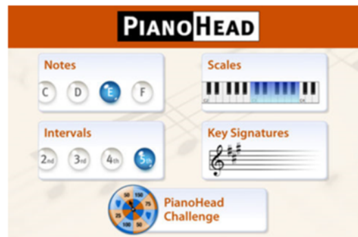
Piano Head app (iOS)

scales, intervals (major ascending only), key signatures, and a challenge mode. The UI is easy to navigate, and the various icons are large enough to tap for adult-sized fingers. The settings menu for each module is a bit limited: for example, in the Note Recognition module, you can only choose natural, sharp OR flat options, and you can only select a 1-octave range at a time (although you can choose to drill yourself on the entire keyboard span—impressive). The Intervals module only drills major and perfect intervals, but you can "hide" the notes to turn it into an ear training exercise. The Challenge round sets a timer and leads you through various modules in increasing levels, which is a nice capstone feature.