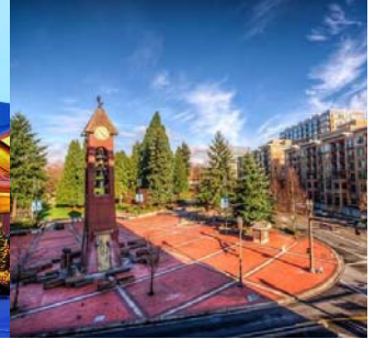
Explore Historic Downtown Vancouver