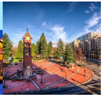
Explore Historic Downtown Vancouver