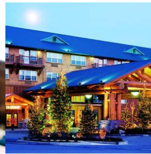
Relax and Rejuvenate at the Heathman Lodge