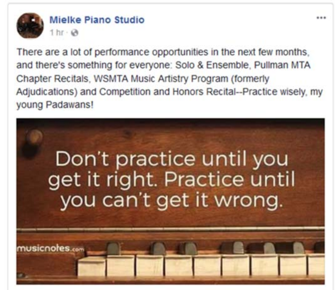
An example of a Facebook post on my business page.

Step 2: Invite your clients to Like and Follow your business page. Promote your page within Facebook and within your studio (add your Facebook link to your email signature and to your webpage). Ideally your business page should be your word-of-mouth community, so add lots of photos and events (see Step 3 to build your community content (it's a great idea to add a line to your studio policies for a parent/guardian signature agreeing to allow their child's photo on the Facebook page; see the helpful article at https://composecreate.com/piano-lesson-photo-release ). Facebook advertising works best if it is personable, so add your clients as your friends on your personal page. If you're uncomfortable with the line between your personal profile and your business page, you can set privacy restrictions so those client-friends are limited in what content they can view on your personal page. Here's a great resource for setting privacy restrictions and filters: www.cmsturjeon.com/itconf/faculty_guide_using_facebook.pdf .