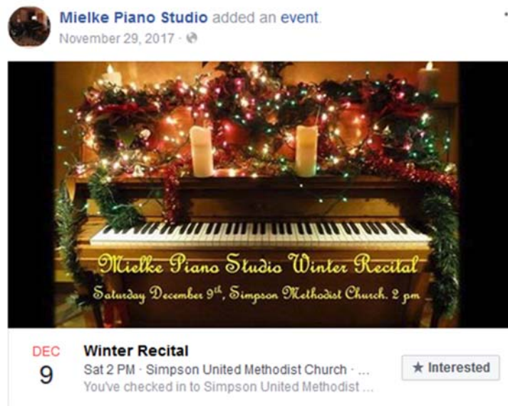
An example of a Facebook event on my business page.

Step 2: Invite your clients to Like and Follow your business page. Promote your page within Facebook and within your studio (add your Facebook link to your email signature and to your webpage). Ideally your business page should be your word-of-mouth community, so add lots of photos and events (see Step 3 to build your community content (it's a great idea to add a line to your studio policies for a parent/guardian signature agreeing to allow their child's photo on the Facebook page; see the helpful article at https://composecreate.com/piano-lesson-photo-release ). Facebook advertising works best if it is personable, so add your clients as your friends on your personal page. If you're uncomfortable with the line between your personal profile and your business page, you can set privacy restrictions so those client-friends are limited in what content they can view on your personal page. Here's a great resource for setting privacy restrictions and filters: www.cmsturjeon.com/itconf/faculty_guide_using_facebook.pdf .