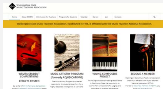
PHOTO COLLECTION FOR WSMTA.ORG