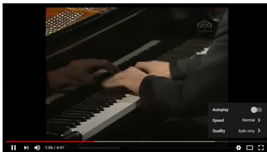
Franz Schubert, IMPROMPTU op 90,2 Krystian Zimerman, Klavier

Converting to Audio Files: There are plenty of online video converter tools (nothing to download to your own computer): Just type "YouTube to mp3" in your search bar and pick any free tool, copy the URL from the video in question (which is the web address at the top of the page, like https://www.YouTube.com/watch?v=L4B1IJmjsyo ) and then convert the video directly to an audio file format (mp3). Once you have the audio file, you can load it onto your preferred device as part of your digital music library, or use in conjunction with a variety of apps, like a chord-identifier app for those students who want to learn to play their favorite song, or a slow-down app that will allow greater control of the playback tempo of the recording.