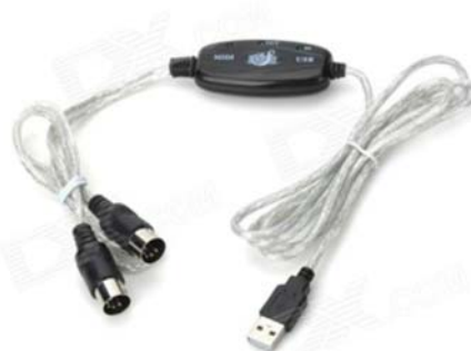
Figure 2: Cables that have a built-in interface with MIDI on one end and USB on the other.

Now here's where it can get fun (or very frustrating): You'll need to plug your MIDI In cable into the MIDI Out port in the interface, and another cable vice versa. The USB end of the interface can plug directly in to your laptop USB port, or if you're using an iPad (like I am in Figure 4 ) you'll need to plug the USB first into a Lightning-to-USB dongle. (My best advice: iOS products seem to work best when directly connected to official Apple gear, so spend the $40 on the "real" Apple dongle, and save yourself from the frustration I had trying to make a cheaper no-name bit of hardware work