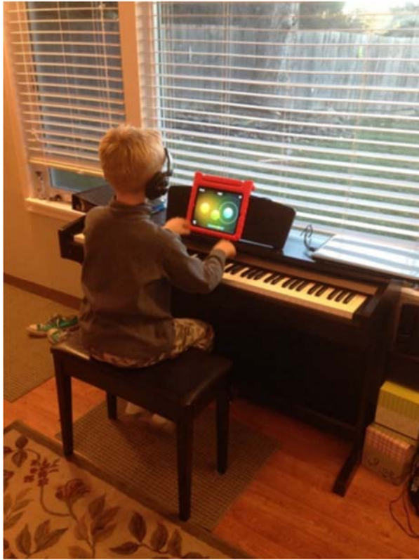
Figure 4: If you're connecting an iPad to your keyboard, you'll need to plug the USB first into a Lightning-to-USB dongle.

correctly). Then you plug the lightning end of the dongle into the port in the iPad. Your headphones will need to plug in to the Output on your mixer (you may need a 1/4"-to-headphone stereo adapter: be sure it's a stereo adapter or you'll only hear audio out of one side of the earphones). Then you'll need a 1/4" audio cable to connect from one mixer input to your keyboard headphone jack, and another 1/4"-to-headphone-cable to connect from another mixer input to your computer or tablet headphone port.