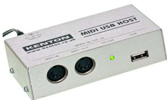
Figure 1: Image of MIDI In & Out inputs (left side) and a USB input (right side)

matter how limited your studio space, or what your intended educational or professional outcome will be, connecting a keyboard to a laptop or other device opens a myriad of potential uses for your space. If you haven't tried to set this up before, here are my best tips to get connected!