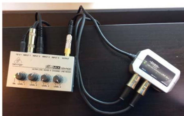
Figure 3: Audio Mixer (left side) and external MIDI Interface (right side)

and USB on the other (see Figure 2 ). These cables cost about $10 each, so this is not a big purchase.