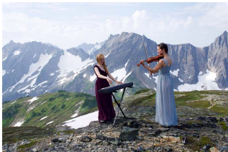
The Musical Mountaineers