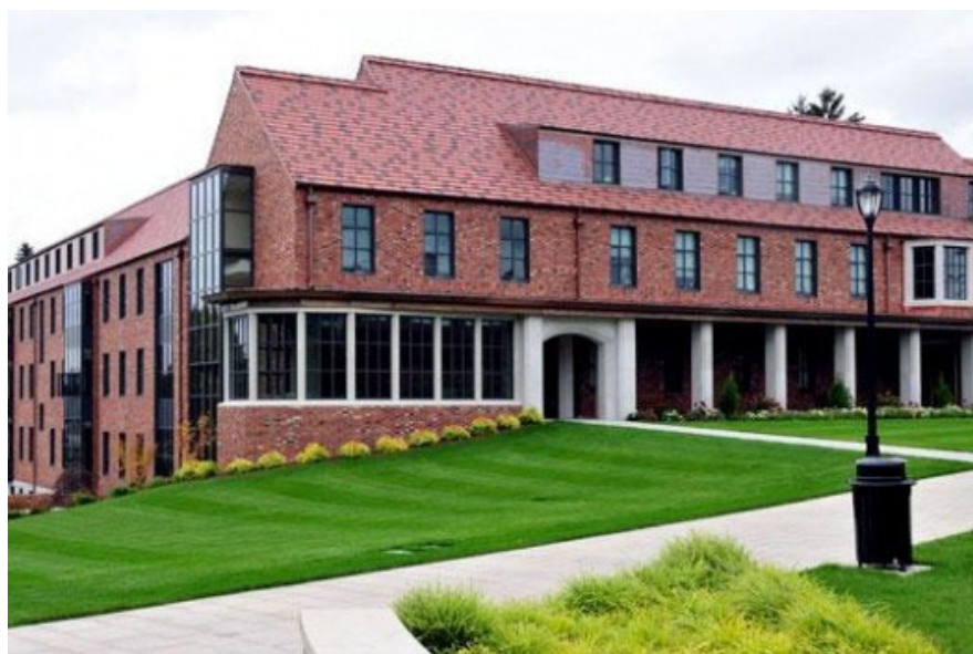
Thomas Hall at the University of Puget Sound