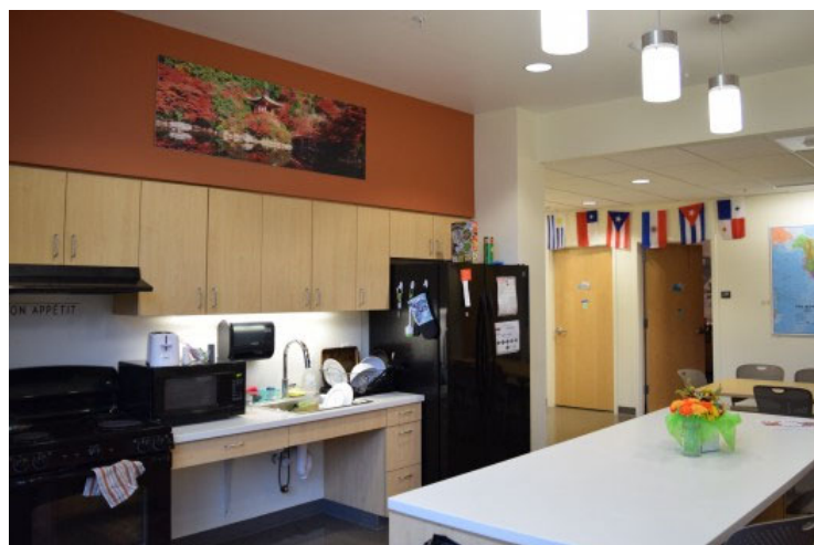
Common Kitchen and Dining area in a flat of rooms at Thomas Hall.