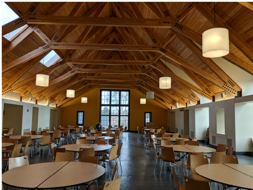
Thomas Hall at the University of Puget Sound