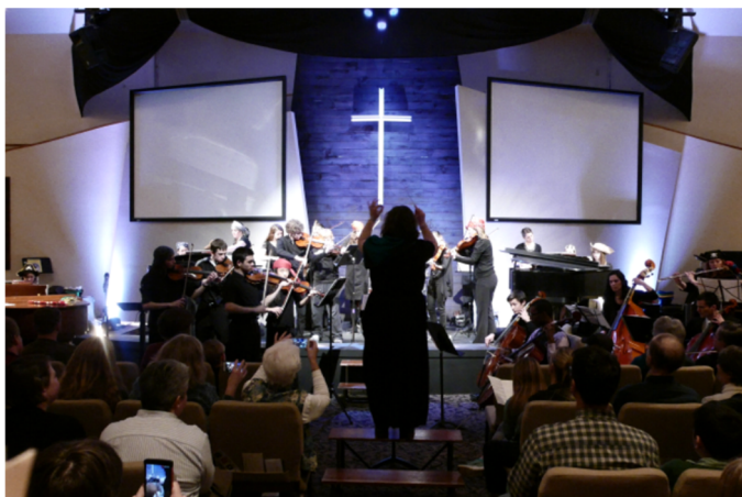
Kitsap County Chapter Monster Concert

We were blessed to host WSMTA's 100th Anniversary Conference back in 2015, and our chapter has many members who also have served or are serving on the state and even national levels. Some of our favorite events are our annual Music Carnival where we host our chapter Music Literacy Program exams amidst a fun Carnival-themed environment with games and ribbons.