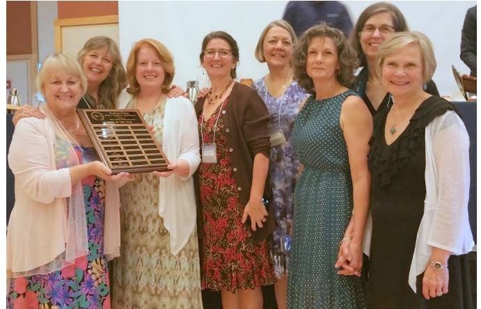
The Kitsap County Chapter accepts the Chapter of the Year Award in 2016