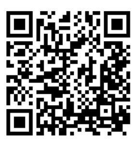
SCAN TO ACCESS PRESENTER BIOS

Reception to follow, sponsored by Anonymous Donor RCA Lobby